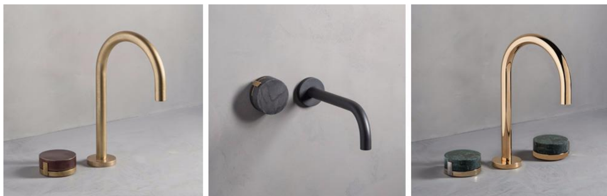
From left to right: Elements collection with Oxblood, Charred and Jungle Covers

Watermark Designs' faucet collection, Elements, offers the ability to play with color, form and texture, in the creation of a unique design statement. Elements is the first self-designed faucet collection; redefining custom designs by giving the consumer an endless possibility of faucet choice combinations. The Elements collection is comprised of 16 handle styles, which are called Covers, and which were designed by the Watermark Designs Studio, are grouped into four material categories: Raw, Rock, Lumber and Forged. RAW was created by JM Lifestyles, USA. The cover features hand poured, sealed and reinforced concrete and is available in Chalk, Military and Poured & Screed. ROCK was created by Marmi Serafini in Italy. The cover features uniquely hand-finished natural stones and marbles and is available in Cararra, Exquisite Rose and Jungle & Volcano. LUMBER was created by WoodForm in the US. The Cover features real wood grain and texture captured and sealed into concrete and is available in Charred, Ground and Smoked & Teak. FORGED, created by Anaka in the UK features handworked and lacquered liquid metal in Oil Slick and Oxblood.